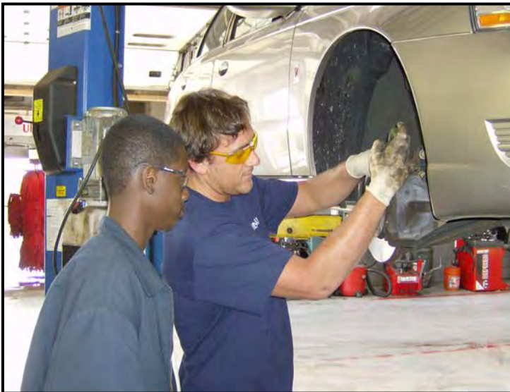
GM Saturn of Newark – May 2008. Job Shadow

The Rodel Foundation is providing a $110,000 grant over two school years to support JA Focus on the Future, an enhanced job shadowing program. This program is designed to give high school students the opportunity to learn what it takes to be a successful member of today's workforce and importantly, to provide context for their high school experience. The grant is aimed to make the often meandering path of high school students more purposeful, by giving them tools to hone their skills around course selection and college preparation. Focus on the Future is being piloted in the Christina School District.