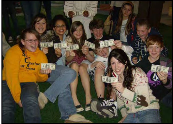
Students who returned with family members to earn $100 at a Hi-Fi event in Winter 2008

The largest single non-capital grant ever awarded Junior Achievement of Delaware came this year from AIG in support of the JA Finance Park program. The $250,000 grant enabled the creation of JA Hi-Fi, where students return to JA Finance Park with their families to experience the budgeting simulation together and earn $100. It also allowed us to develop seminar versions of JA Finance Park designed to impact students in a traditional learning environment. AIG enabled Junior Achievement to have the innovation of swipe technology with the JA Finance Park debit card, making the simulation ever more realistic to kids. More so, AIG enabled the addition of an integrated credit score curriculum in