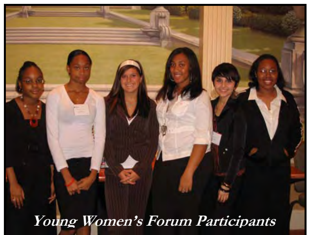
Young Women's Forum Participants

The 6th annual Young Women's Forum was held on November 13, 2008. Fifty young women from public, charter, and technical high schools spent the day with volunteer career coaches. Together they attended workshops presented by volunteers from the business and education communities that were focused on work-readiness skills, financial literacy and higher education. Highlights of this year's event were the women who spoke about their career paths during an inspiring panel discussion. Students also attended a helpful presentation about college financial aid, a "dress for success" workshop, and the college fair sponsored by local universities.