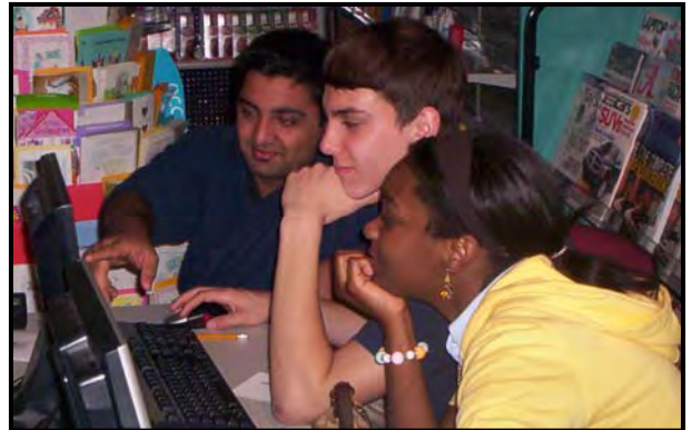
Students make their next strategic decision to win!

The Junior Achievement Titan program, in which high school students assume the role of top company management as they apply their economic knowledge and skills to win market share and profit for their shareholders is an exciting way for students to learn about the market economy. This online business simulation is an add-on to one of Junior Achievement's oldest curricular programs: JA Economics ®. High school students that participate in JA Economics and the JA Titan program are eligible to end the year in a final competition for money & prizes. This year's winners from Archmere Academy's "Team One" received mountain bikes donated by ING DIRECT. The event was sponsored by Mastercard.